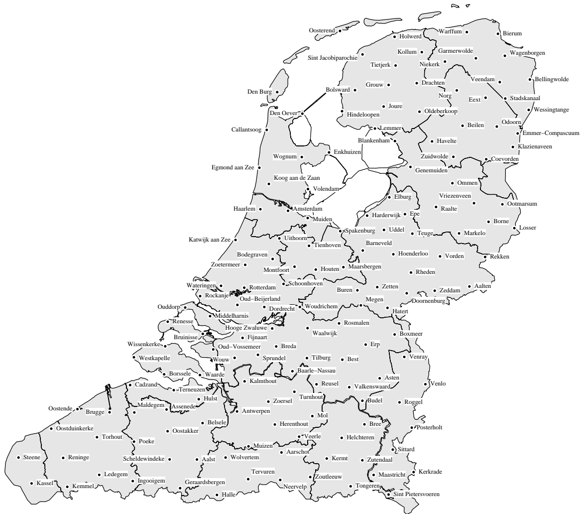
Figure 2.3: The locations of the 156 varieties which were selected from the RND by the Hoppenbrouwers brothers.