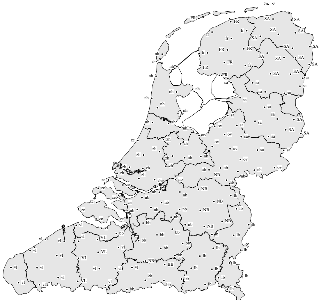
Figure 2.4: The main division of the Dutch dialects according to the feature frequency method of the Hoppenbrouwers brothers distinguishes ten areas: fr=Frisian, sa=Saxon, ov=Overijssel, nh=Noord-Holland, zh=Zuid-Holland, ze=Zeeland, nb=Noord-Brabant, lb=Limburg, bb=Belgian Brabant, vl=Flemish. Core dialects are given in upper case, and peripheral dialects in lower case. The corresponding names of the locations can be found in Figure 2.3.